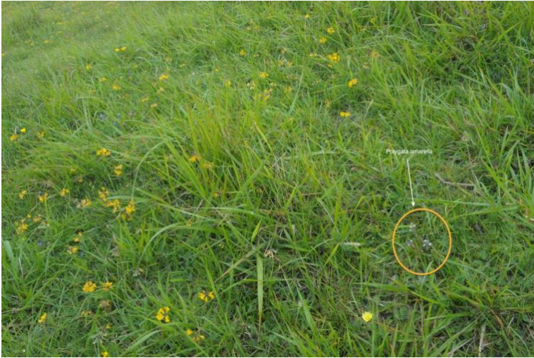
In chalk grassland, nestling at the edge of Tor-grass tussocks