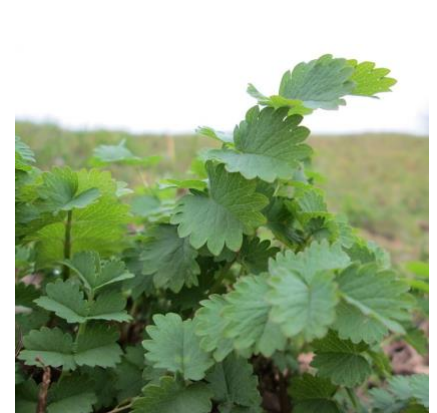
Salad Burnet ( Poterium sanguisorba )