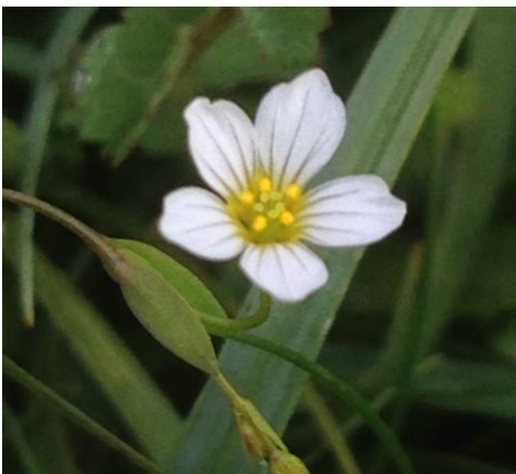
Fairy Flax ( Linum catharticum )