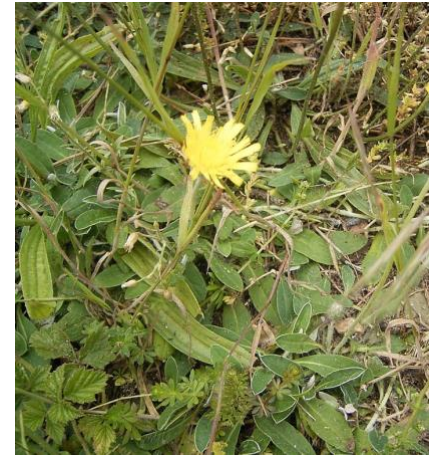
Mouse-ear Hawkweed ( Pilosella officinarum )