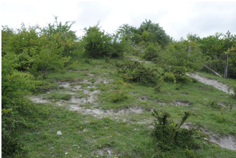
In thinner swards, often associated with bare soil and sometimes sheltered by shrubs which protect it from grazing