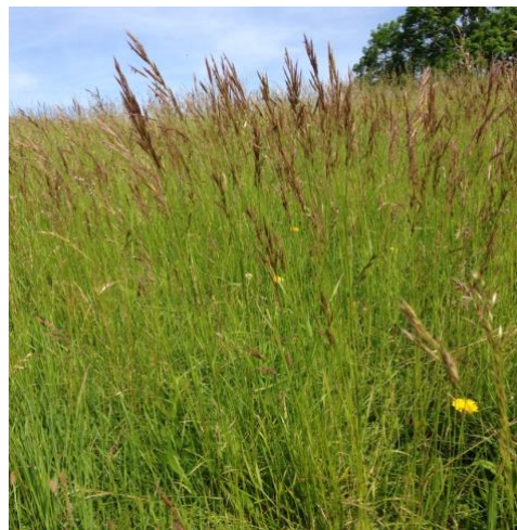
Upright Brome ( Bromopsis erecta )