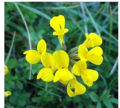
Horseshoe Vetch ( Hippocrepis comosa )