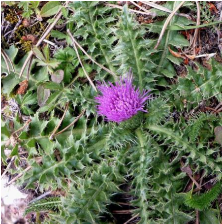
Dwarf Thistle ( Cirsium acaule )