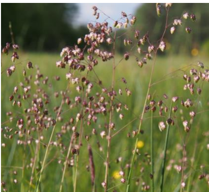
Quaking Grass ( Briza media )