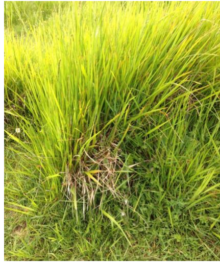
Tor-grass ( Brachypodium pinnatum )